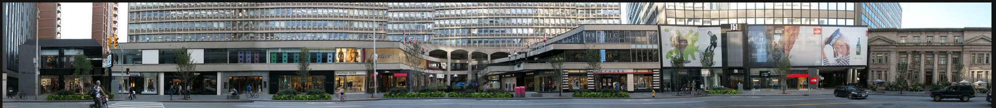
Dolce & Gabbana